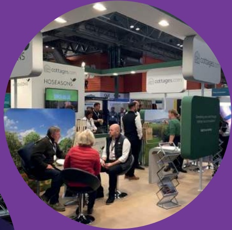
Farm Business Innovation