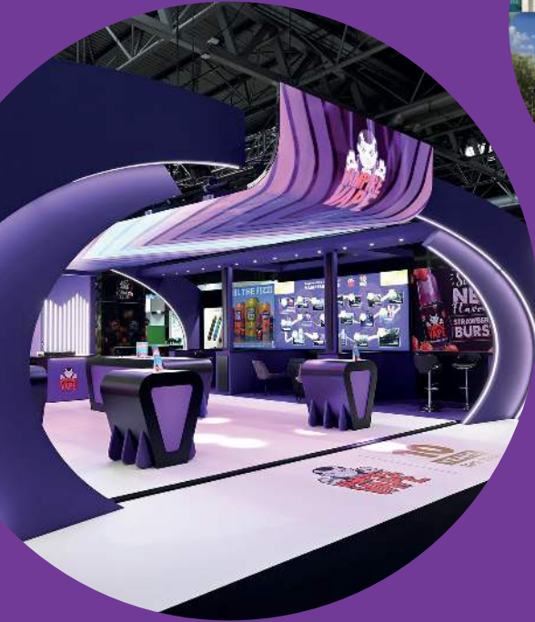
The Vaper Expo